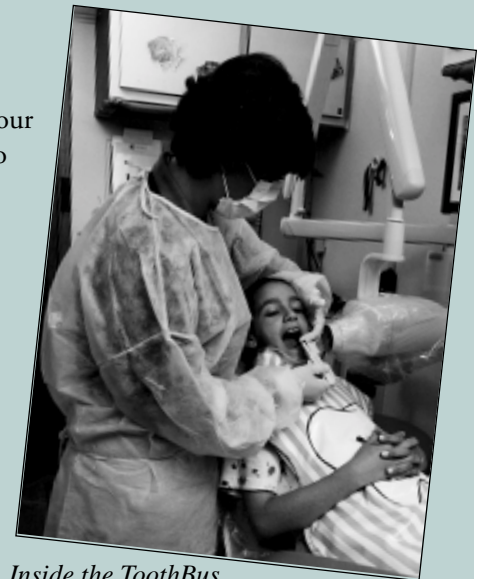
Inside the ToothBus . . .

It’s amazing how fast seed money can grow.