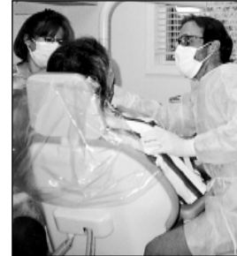
Western NC Community Health Services

Clay County Health Department — Since 1997, the department has operated a small, part-time clinic leased from the Cherokee County Eastern Band of Cherokee Indians. From this office, the