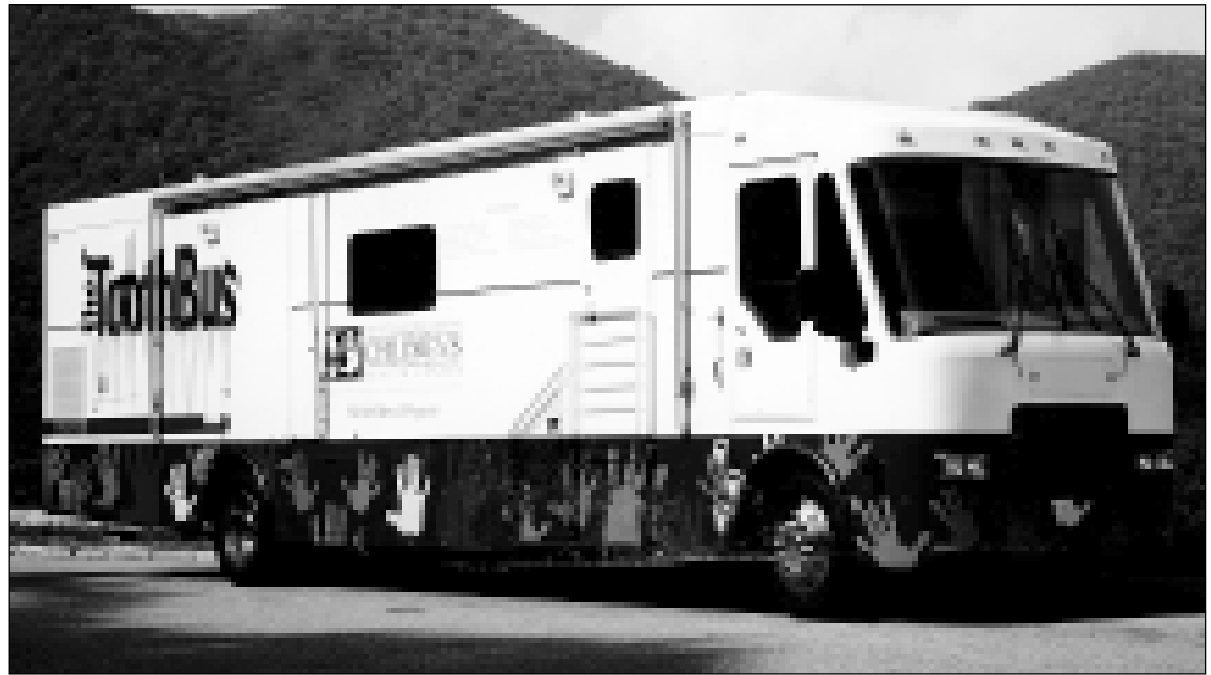
The ToothBus is a 40-foot dental office on wheels that serves children who have no other access to dental care. It is a program of the Billy Graham Children's Health Center at Mission St. Joseph's Hospital in Asheville.

• Roanoke Amaranth Community Health Group ..... 3